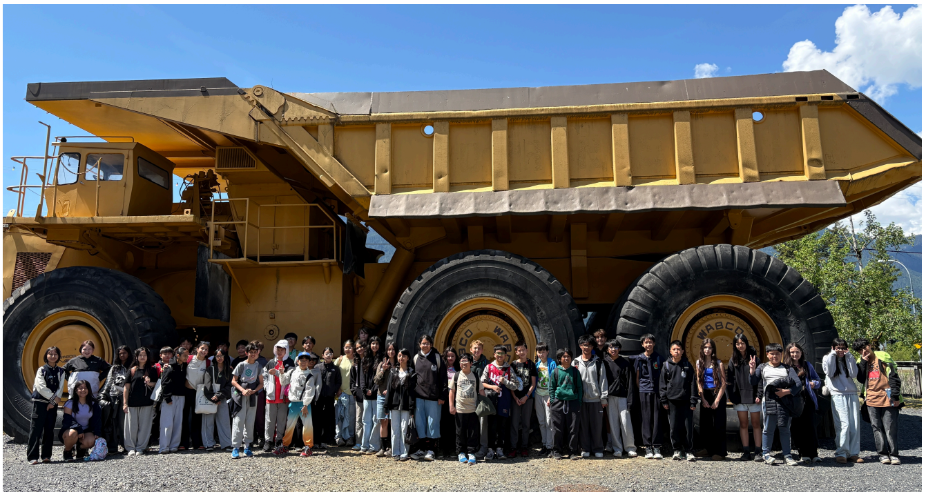
Divisions 1 and 2 at the Britannia Mine Museum